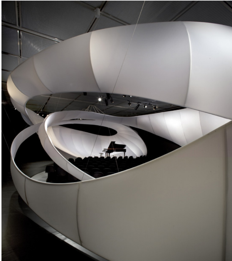
Temporary Chamber Music Space by Zaha Hadid