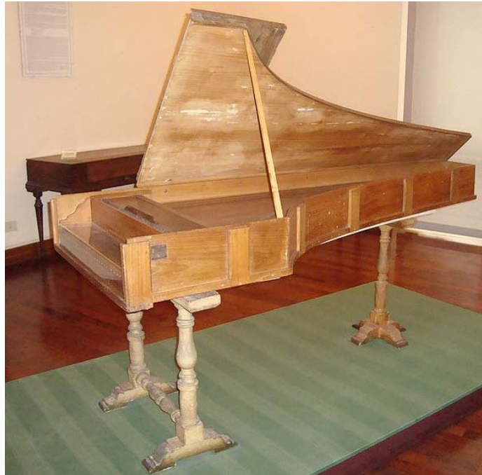
Cristofori Piano of 1720

The violin evolved from earlier bowed stringed instrument precedents such as the vielle, rebec, and lira da braccio. By the mid 1500s the Italian cities of Brescia and Cremona were known as centers of stringed instrument making. Gasparo da Salò, active between 1530 and 1615 is credited with developing the form of the modern violin. The Cremonese school of violin making produced the Niccolò Amati family, active until 1740, the Giuseppe Bartolomeo Guarneri family, active between 1626 and 1744, and the Stradivari family, active between 1644 and 1737. These craftsmen were just common instrument makers in their day producing stringed instruments of all kinds (violin, viola, cello, guitar, and mandolin) for contemporary players and the royal court orchestras. Little did they know their works, of which less than 500 are extant, would fetch prices in excess of $3M USD 300 years later.