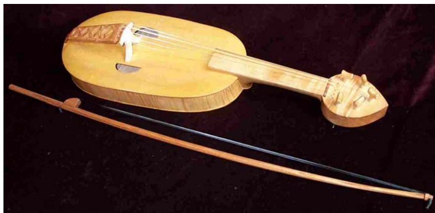
A Modern Reproduction of the Vielle and Concave Bow

Instrumental music was certainly performed prior to 13 th century, as indicated in period artwork and poetic references, but which instruments were used is not known since music scores did not indicate instrumentation. Around the 13 th century composers started indicating the instruments to be used for performance. Medieval performers used earlier Greco-Roman instruments such as the lyre but developed their own instruments which evolved into their modern equivalents. The lyre, used to accompany vocal music, evolved into the harp. The vielle was a five stringed bowed instrument which evolved into the viol and later the violin. The psaltery was a zither-like instrument in which the strings were struck and evolved into the clavichord. The lute came from Iberia via the Arab conquerors. The pipe organ evolved into the portative organ that was transported to performance spaces. Other common instruments included the flute, horn, bagpipe, and drums used for keeping time in dance pieces.