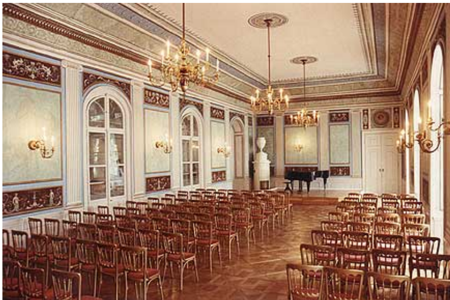
Empire Hall Esterházy Palace

The Esterházy family of Hungary built several court palaces, one of the most famous being in Eisenstadt, where Haydn was court composer and conductor between 1761 and 1791. Many of his chamber music pieces, such as the Imperial Quartet, were composed and performed in the Empire Hall. The hall was originally a dining room and was remodeled into a concert hall around 1800. Seating approximately 180, the room is roughly 30 ft by 60 ft by 20 ft high and has reverberation time of 1.5 seconds.