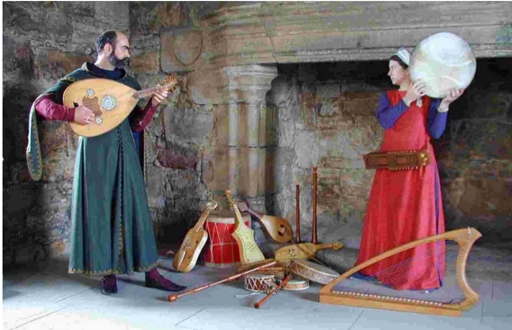
Medieval Musicians with Lute, Vielles, Flutes, Drums, Psaltery, and Harp

In the late Medieval period larger instrumental ensembles appeared as was common practice for outdoor performances where instrument groups were noted as “haut” (high) and “bas” (low), referring not to pitch, but to loudness. Instruments were not grouped by common timbre, such as vielle, viol, lute, and psaltery, but by contrasting tonal color such as viol, lute, trumpet, and drum. This resulted in a tone quality that was bright, clear, and able to carry long distances.