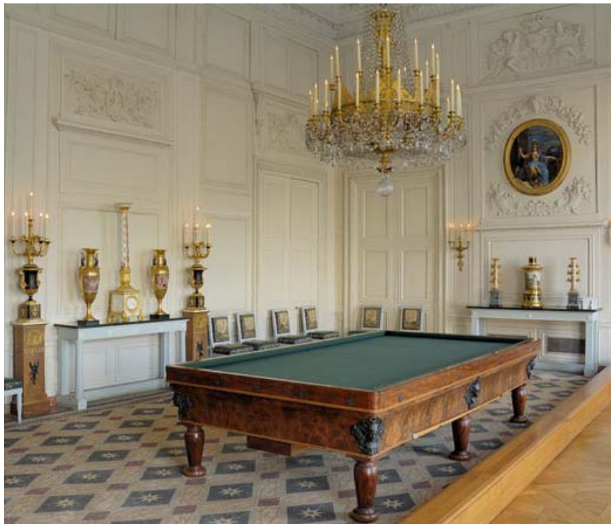
Versailles Palace Music Room in Louis XIV Apartment – Pool Table Installed by Louis XVI

Courtly palaces were built with little regard for cost and utilized the most exquisite materials and finishes executed by the finest craftsmen. Most palaces had opera and instrumental music performance rooms. The opera rooms could accommodate larger audiences than the instrumental rooms. Like the Medieval palaces, acoustic conditions were likely moderately reverberant, 1.5 to 3 seconds, in the instrumental rooms.