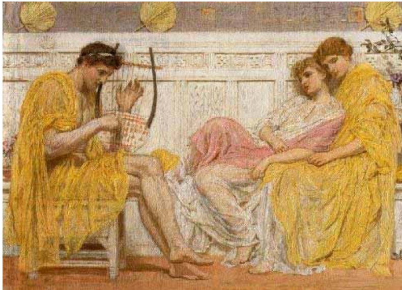
18 th Century Painting Depicting a Greek Musician Playing a Lyre

theory, and practice evolved as part of early Christian and Medieval music practice.