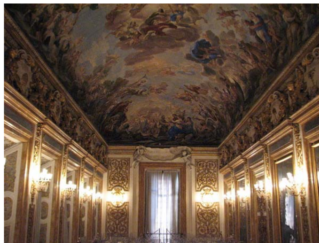
Interior of Medici Palace Music Room

Secular music was frequently performed in the houses of patrons. One of the most prolific Renaissance arts patrons was the Medici family. Their villa in Florence, the Palazzo Medici Riccardi, was commissioned by Cosimo de' Medici in 1444 and designed by the architect Michelozzo Michelozzi (1396-1472). Music was frequently performed in the villa's many stately rooms. These rooms were large, had high ceilings, and were finished in marble, plaster frescoes, and stone floors. Even though many of the rooms had tapestries and carpets, reverberation times typically exceeded 2 seconds.