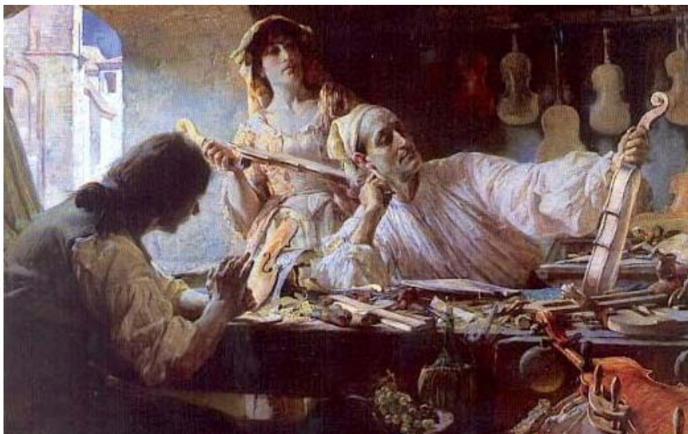
Painting of Stradivarius in His Workshop Examining an Instrument in the White

The violin evolved from earlier bowed stringed instrument precedents such as the vielle, rebec, and lira da braccio. By the mid 1500s the Italian cities of Brescia and Cremona were known as centers of stringed instrument making. Gasparo da Salò, active between 1530 and 1615 is credited with developing the form of the modern violin. The Cremonese school of violin making produced the Niccolò Amati family, active until 1740, the Giuseppe Bartolomeo Guarneri family, active between 1626 and 1744, and the Stradivari family, active between 1644 and 1737. These craftsmen were just common instrument makers in their day producing stringed instruments of all kinds (violin, viola, cello, guitar, and mandolin) for contemporary players and the royal court orchestras. Little did they know their works, of which less than 500 are extant, would fetch prices in excess of $3M USD 300 years later.