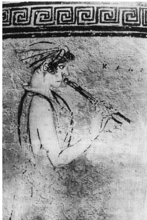
Figure 2. Vase Painting Showing a Greek Musician Playing an Aulos