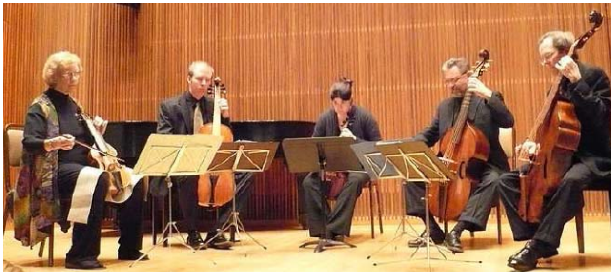
A Consort of Viols – The Smithsonian Chamber Players

Compositions became increasingly elaborate with highly independent voices often including improvisation by soloist performers. Published partbooks for each voice or instrument enabled performers to more closely play what composers intended. Performances by larger groups became frequent with four or more musical lines of similar sonority being a common musical form. All musical lines were viewed as equally important, but the ideal was a homogenous sound, so the consort – a complete set of instruments within a family – from bass to soprano evolved. The viol and recorder consorts were particularly popular.