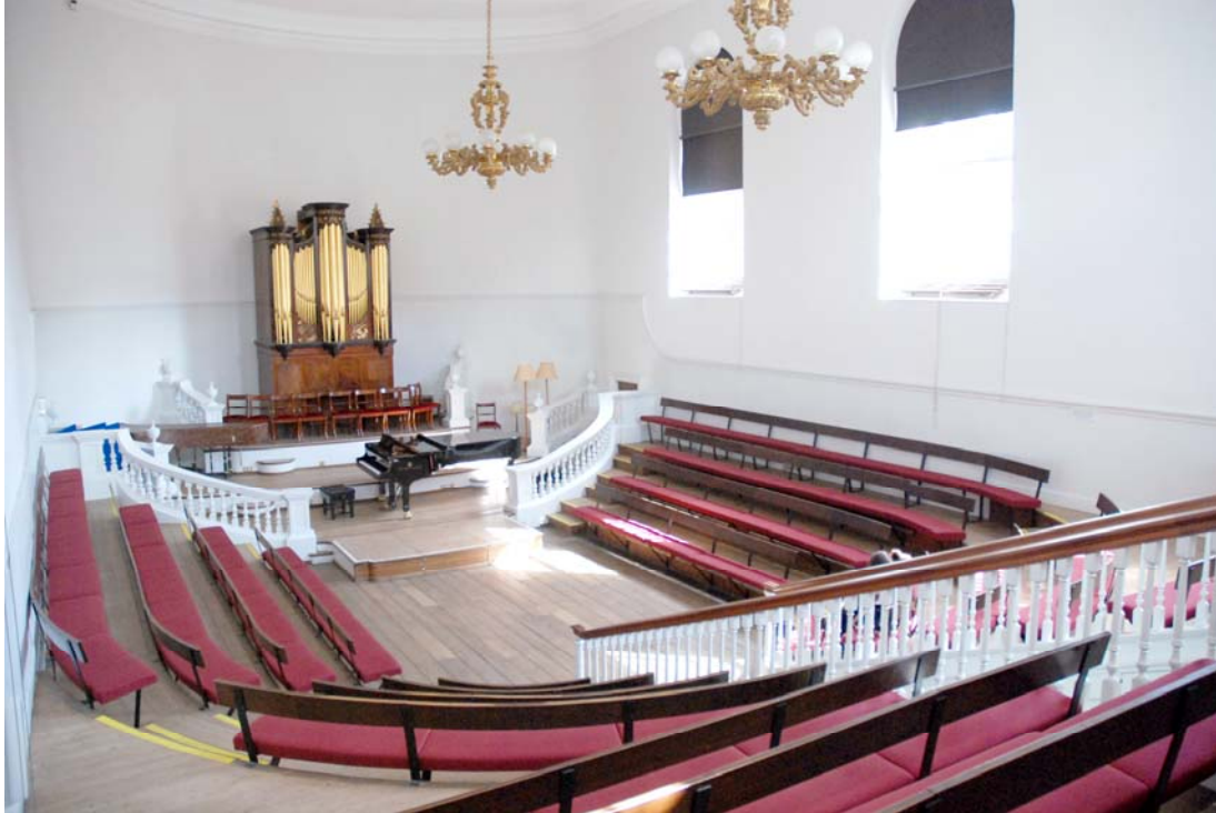
Holywell Music Room Oxford, UK

awkward for all but the smallest chamber ensemble. Acoustic measurements indicate reverberation time of 1.5 seconds.