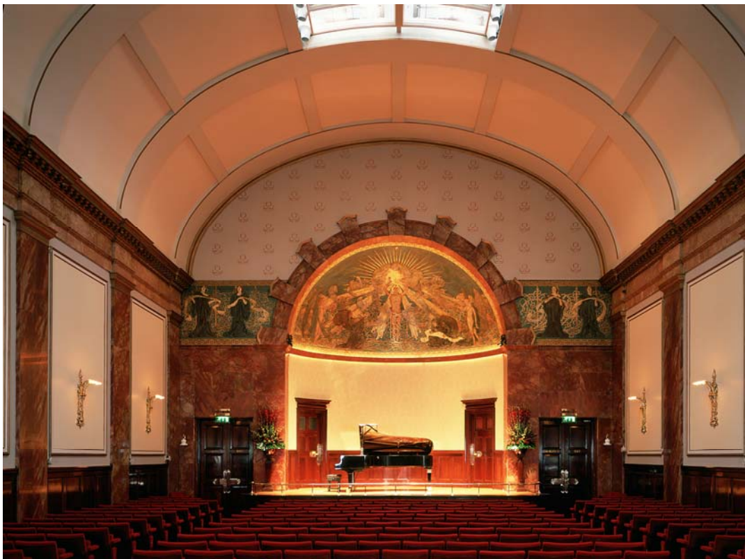
Wigmore Hall, London England

The architect was Thomas Edward Collcutt, FRIBA. The room is 85 ft by 43 ft and features a barrel valued ceiling 40 ft high with skylights and a small rear balcony. Sumptuously appointed in a quasi arts and crafts style with a cupola as part of a small alcove-shaped stage, and seating 540 mostly on a flat floor, the room in many regards is the antithesis of modern acoustic design practices. Occupied reverberation time is 1.5 seconds.