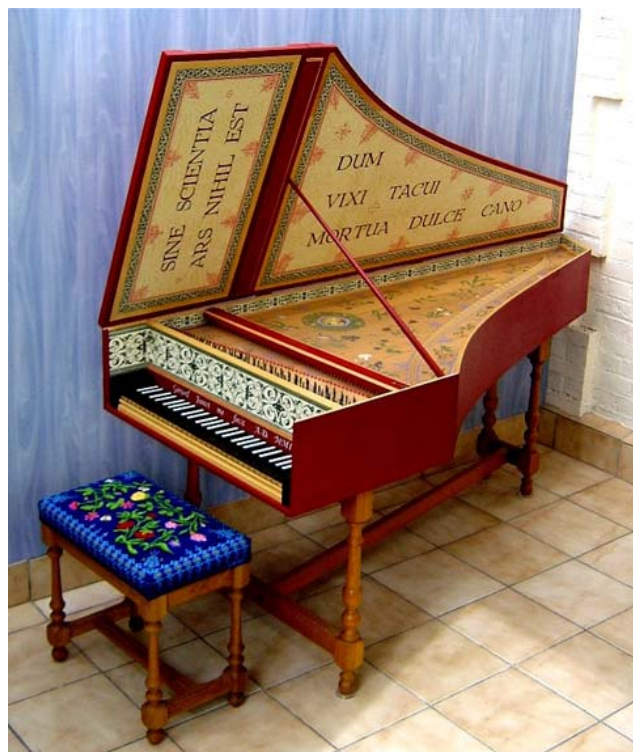
Modern Reproduction of an English Harpsichord

The earliest known reference to the harpsichord dates from 1397, but Henri Amault de Zwolle in 1440 illustrates in a musical instrument book the standard harpsichord mechanism, with jacks holding plectra mounted on retractable tongues, and the strings perpendicular to the keyboard. Because of its larger size and greater acoustic power, the harpsichord was used in both solo and larger ensemble performances.