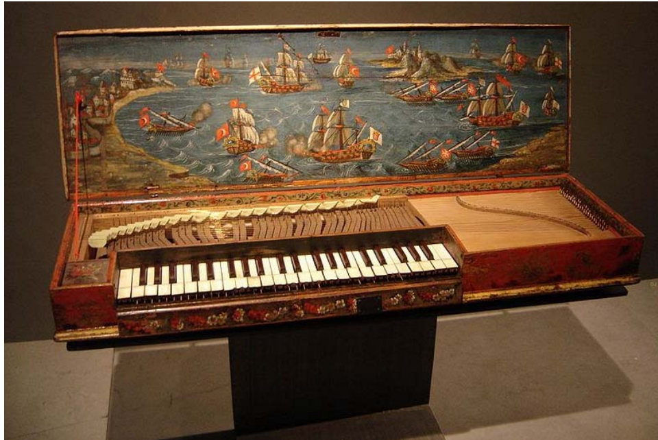
Modern Reproduction of 14 th Century Clavichord

The earliest known reference to the harpsichord dates from 1397, but Henri Amault de Zwolle in 1440 illustrates in a musical instrument book the standard harpsichord mechanism, with jacks holding plectra mounted on retractable tongues, and the strings perpendicular to the keyboard. Because of its larger size and greater acoustic power, the harpsichord was used in both solo and larger ensemble performances.