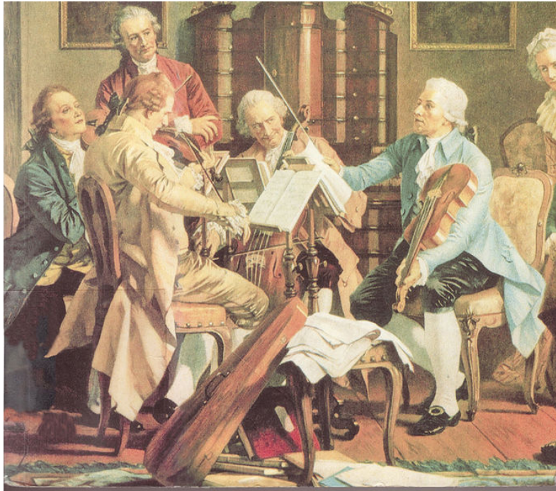
Joseph Haydn playing viola in a string quartet

Ludwig van Beethoven (1770 to 1827) transformed chamber music in terms of compositional form and the demands made on performers and audience. His first public exposure was through his piano trios opus 1 in 1791 but his opus 20 septet composed in 1800 for clarinet, horn, bassoon, violin, viola, cello, and contrabass, dedicated to Empress Maria Theresa, established him as a popular composer. The septet is written as a classical divertimento in six movements, including two minuets, and a set of variations. It is full of memorable tunes, with solos for everyone, including the contrabass. Opus 20 and various transcriptions of it for other instruments was such a success that Beethoven feared it would eclipse his future works.